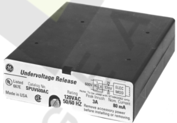
Figure 1. Undervoltage Release.

When the applied control voltage is above 80% of the UVR's rated value, the breaker can be closed. When the voltage drops to 35–60% of the rated value, the UVR will trip the breaker.