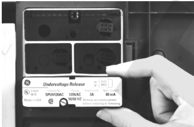
Figure 3. Inserting the Undervoltage Release into the accessory compartment.