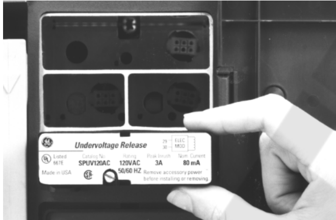
Figure 3. Inserting the Undervoltage Release into the accessory compartment.