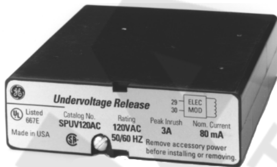
Figure 1. Undervoltage Release.

The catalog numbers for the UVR for various voltage applications are listed in Table 1.